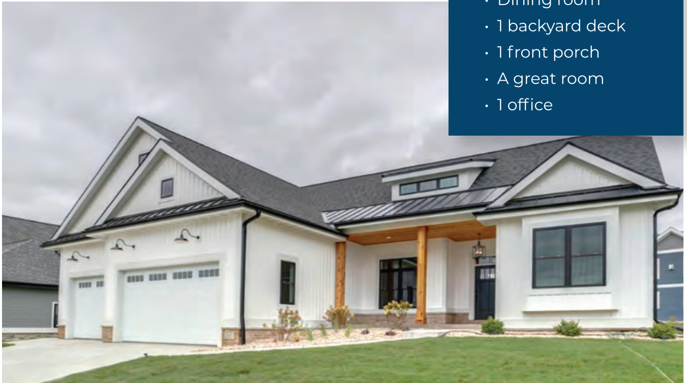
Main floor plan