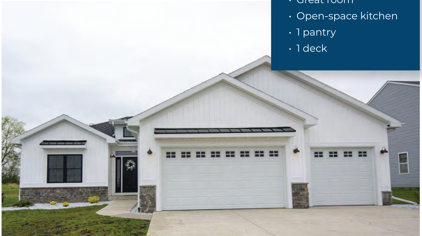
Main floor plan